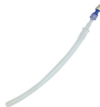
vein tube (a set of 4) 11486-020