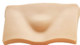
replacement skin 11486-030