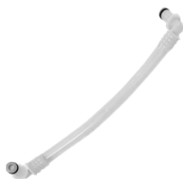
artery tube (a set of 4) 11486-010