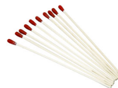
cotton swab red (set of 10) 11388-400